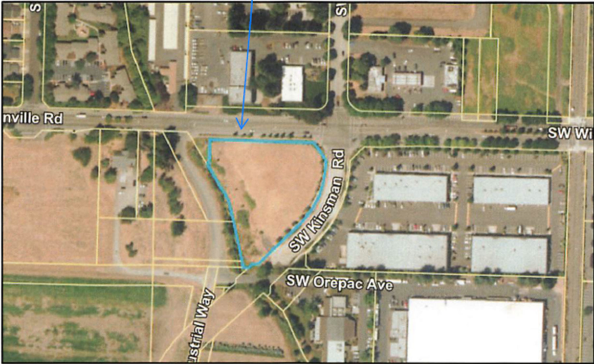
Detail Aerial Photograph