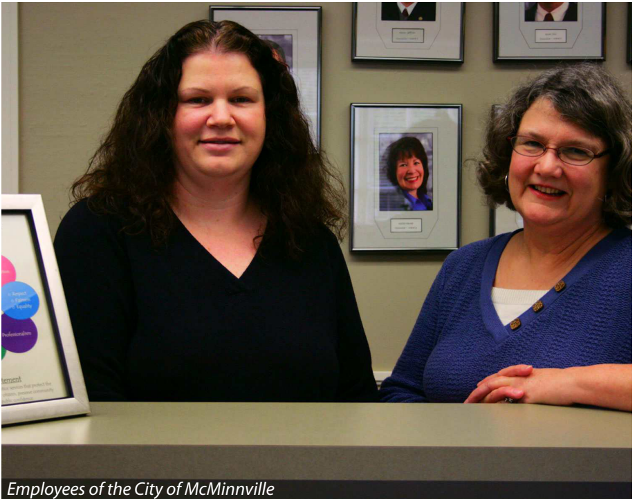
Employees of the City of McMinnville